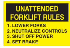
7G9000 (7" x 10") 7L9000 (10" x 14") V - PL - A