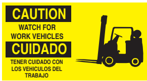
16GB6310 12" x 15" V - PL ONLY