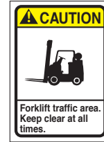
AN-S110 10" x 14" V - PL - A