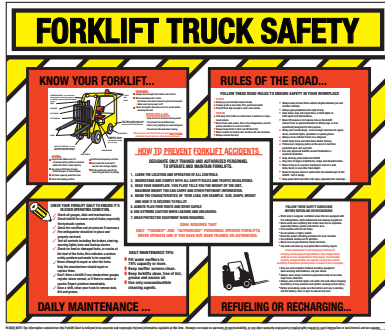
FKL-2226 SPFKL-2226 (SPANISH)

This informative forklift chart points out each part of a forklift truck, and includes rules of the road, accident prevention, daily maintenance and more. Made of .010 tear-resistant vinyl. Size is 22" x 26".