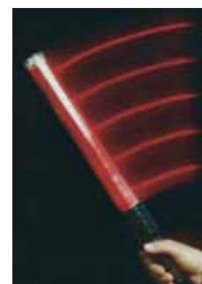
BB069 FLASHBACK™ LED Light Baton $28.95

The FLASHBACK™ LED Light Baton is the most visible flashing signal light available. The 6 highly-luminous LED bulbs can be seen for up to ¾ of a mile and flash approximately 150 times per minute. FLASHBACK™ provides a minimum of 300 hours of continuous flashing operation. The three stage switch provides off, flashing or steady light. The weather resistant body is made of ABS high impact plastic, while the tube is PC transparent material. Ship. wt. 1 lb.