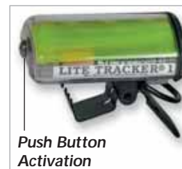
Push Button Activation