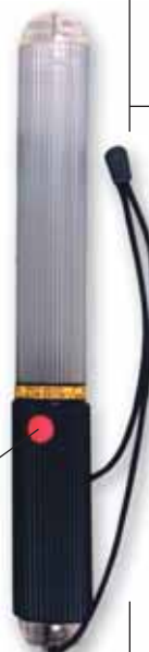
AM202 Glow Baton™, Red $32.95 AM203 Glow Baton™, Red/Green $42.95 AM204 Glow Baton™, Red/Green/Blue $53.95