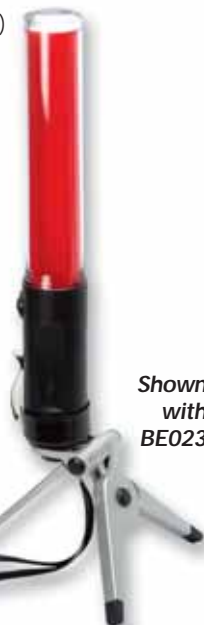
Shown with BE023