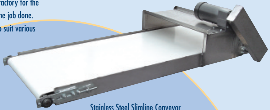
Stainless Steel Slimline Conveyor

If you don't see what you need in our catalog, consult the factory for the design and engineering of the specific model that will get the job done. Here are some examples of specialty items we have built to suit various custom fit jobs.