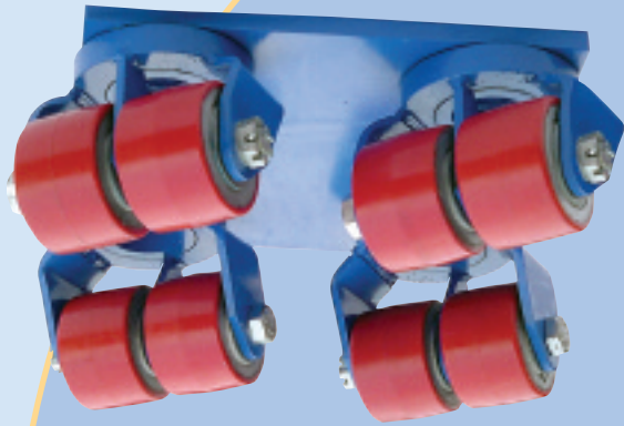
34 Ton Dolly