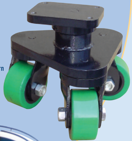
Heavy Duty Turn Table Dolly