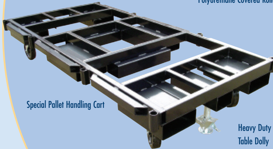
Special Pallet Handling Cart