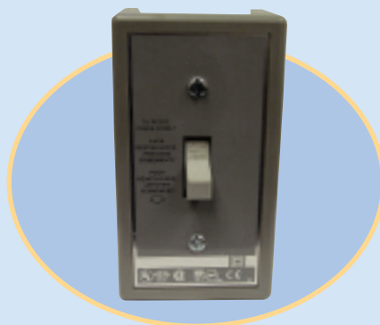
► STARTER WITH ON/OFF SWITCH For 110-1-60 Motors