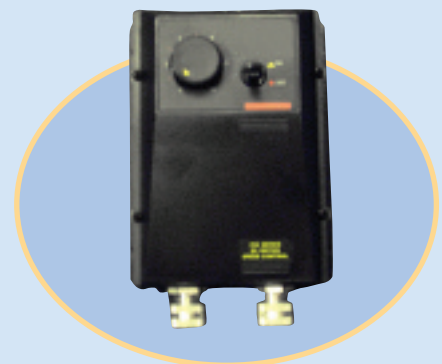
► DC SPEED CONTROLLER For 1/4 - 1 HP DC Motors 110-1-60