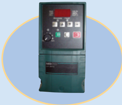
► AC DRIVE CONTROLLER For 230-3 Phase and 460-3 Phase Motors