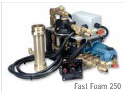
Fast Foam 250