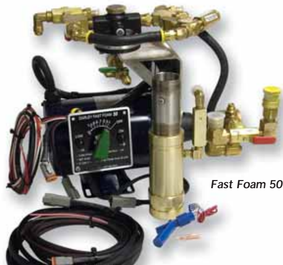
Fast Foam 50

Features: The Fast Foam systems offers a reliable, accurate, compact foam proportioning system at an economical price. The systems are optional and for use on single and dual line systems.