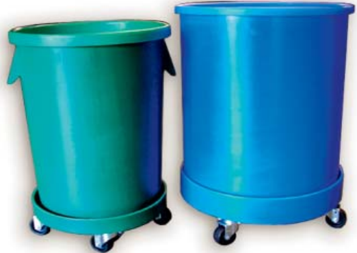
AH-33 & MM-45 barrels in matching color MD-20 & MD-24 molded dollies