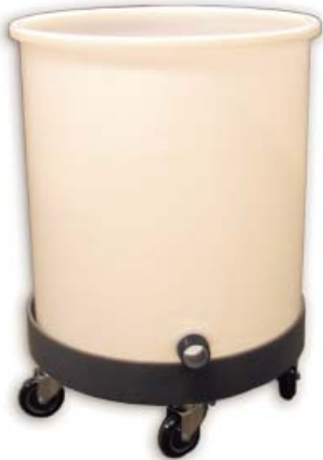
MM-49 barrel with threaded spigot in MD-24 dolly