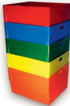
Multi-colored JCP-1 nesting containers