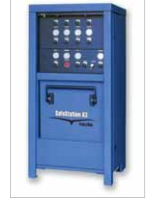
Baron3 may also be purchased as separate components Talon2 Compressor and SafeStationX3.

Raptor compressor dimensions: 66"Hx34.5"Wx32"D