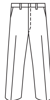
Uniform Style Pants