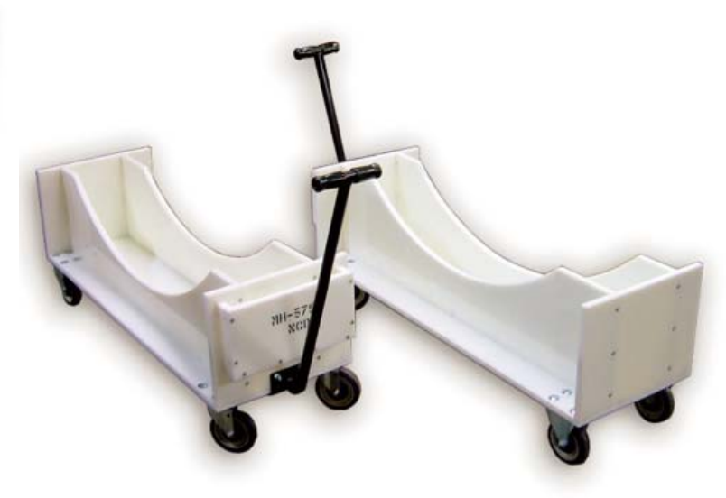
Fabricated steel cart made for GE operations