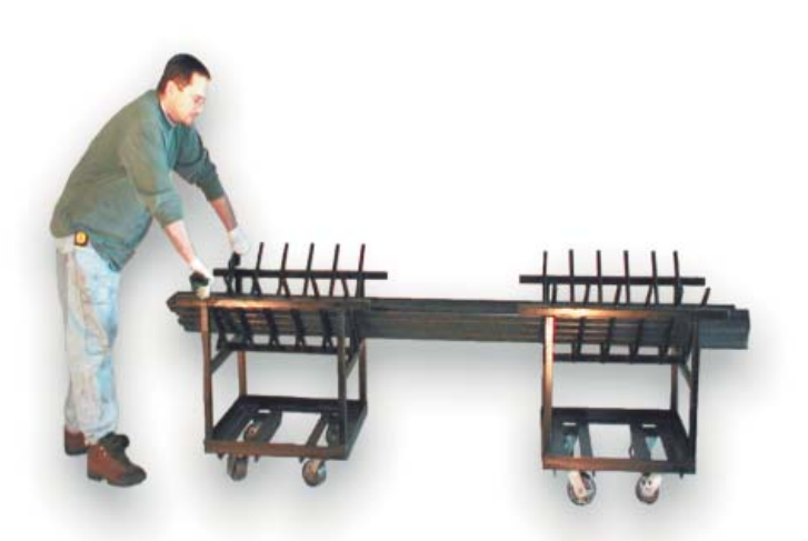
Loaded HDV carts in transit.

"V"-Trucks are useful for moving long or bulky items within a facility. With weight capacities up to 4000 pounds, they are perfect for manually transporting bundles of steel or other extremely heavy items. Trucks can be paired off for long items and to provide even greater weight capacities. All-welded steel construction ensures a long life under severe conditions.