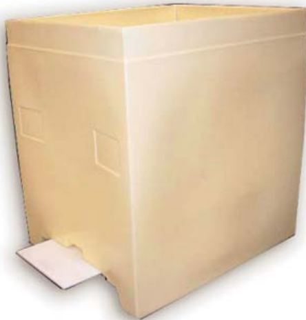
CM-52 with slide gate partially open

Many of our pallet container designs originate from our customers. With our in-house mold-fabricating ability, we are able to make the part you need quickly and efficiently to your specifications. An example of a custom container is shown to the right - our part number CM-52. It was designed as a large parts hopper with a sliding bottom gate. Overall size is 48" x 40" x 52" tall. Inside top dimensions are 45.5" x 37.5" x 48".