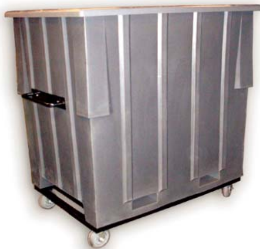
KC-52 modified with caster platform and steel handles

We can modify our pallet containers to match your unique needs. Modifications include heavier wall thickness for added weight capacity, mounting casters on the containers, metal frames, drop sides, sight windows, fabricated lids, enlargement or shrinkage of standard sizes and any other suggestions you might come up with!