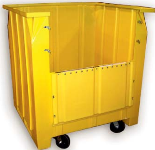
GG-48 modified with drop door and casters

We can modify our pallet containers to match your unique needs. Modifications include heavier wall thickness for added weight capacity, mounting casters on the containers, metal frames, drop sides, sight windows, fabricated lids, enlargement or shrinkage of standard sizes and any other suggestions you might come up with!