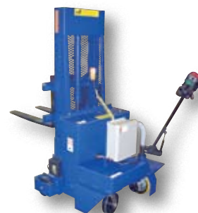
PALLET MASTER/PALLET SERVER WITH PTDS OPTION