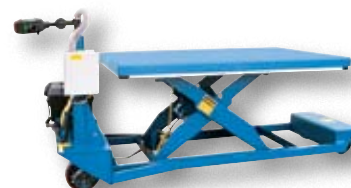
PORTABLE SCISSOR TABLE WITH PTDS OPTION