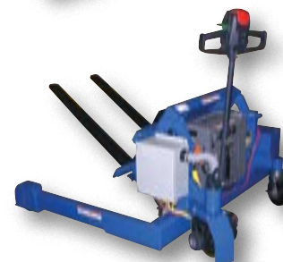
TILT MASTER STRADDLE WITH PTDS OPTION