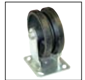
"V" GROOVE model AHA-2/4-V