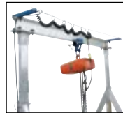
FESTOON SYSTEM model AHA-FES-KIT