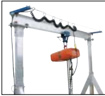
FESTOON SYSTEM model AHA-FES-KIT