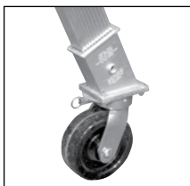
STANDARD 4-POSITION 8" PHENOLIC SWIVEL CASTER