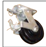
TOTAL LOCKING model AHA-2/4-TLC