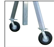
PNEUMATIC CASTERS model AHA-PNU