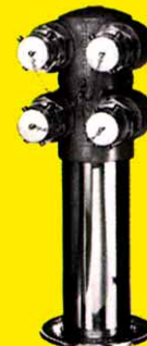
5775 & 5776

SPECIFY: Thread and lettering Overall Height: 34"/86.3 cm Radius of Body Swing: 8"/20.3 cm