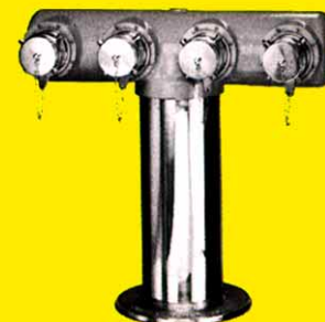
5785 & 5786

SPECIFY: Thread and lettering Overall Height: 26½"/67.3 cm Radius of Body Swing: 17"/43.1 cm