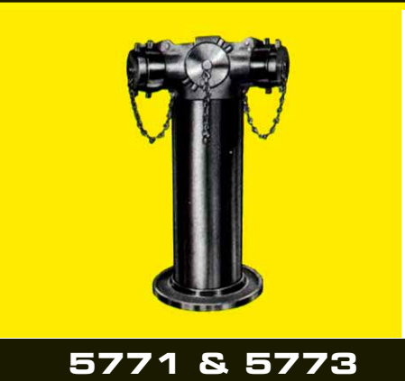
5771 & 5773