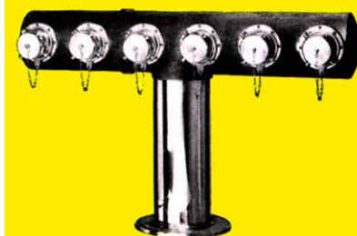
5791 & 5792

SPECIFY: Thread and lettering Overall Height: 26½"/67.3 cm Radius of Body Swing: 25"/63.5 cm