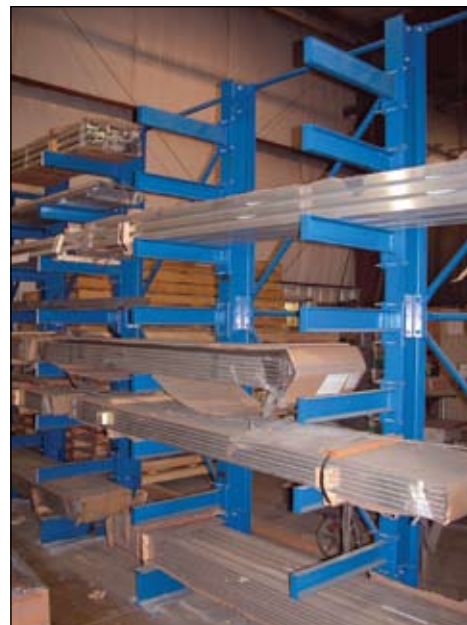
SINGLE-SIDED CANTILEVER UPRIGHTS series SAC