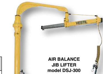
AIR BALANCE JIB LIFTER model DSJ-300