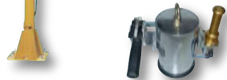
PNEUMATIC VACUUM model VAC-6