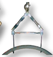
DOUBLE HOOK model LMEC-DH