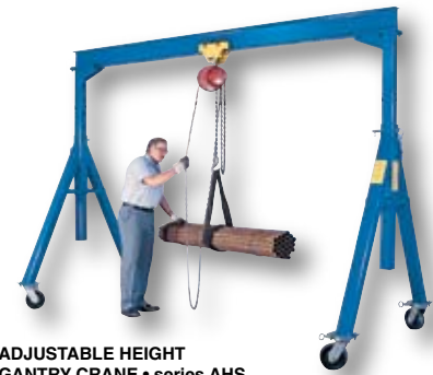
ADJUSTABLE HEIGHT GANTRY CRANE • series AHS

Note: All products should be inspected frequently to insure safe operation. Final testing and inspection is left to end user after final assembly has been completed. For further details see ASME B30.17.