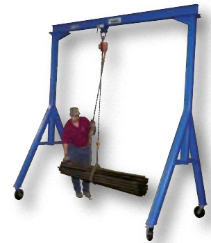
FIXED HEIGHT STEEL GANTRY CRANE series FHS

USABLE DISTANCE BETWEEN UPRIGHTS IS OVERALL BEAM LENGTH MINUS 10½" USABLE TROLLEY TRAVEL LENGTH IS OVERALL BEAM LENGTH MINUS 30"