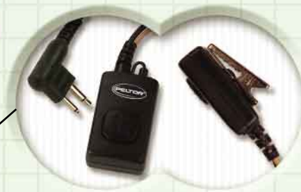
Belt PTT Detail

Small finger PTT with velcro strap can be custom mounted (hand, finger, belt, sleeve, pocket, jacket collar, etc) allowing for hands-free radio transmit ability