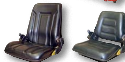
LTSD-V with seat belt