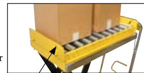
Retractable End Stop

Provide smooth and easy flow from cart to workstation. Attaches to any scissor table, cart or work bench with a deck length of 32". Allows you to position objects easily. Features retractable end stops so items won't slide off during transit. Ideal for use at feed tables for sheet metal working machines, press brakes, and machine centers. Adds 3¾" to lowered and raised height of cart.