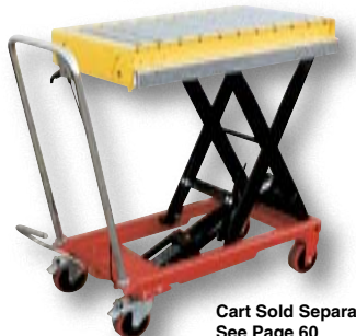
Cart Sold Separately. See Page 60