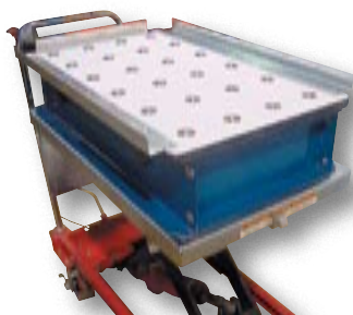
Cart Sold Separately. See Page 60