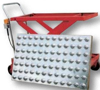
Shown with a Hydraulic Scissor Cart (Cart Sold Separately)