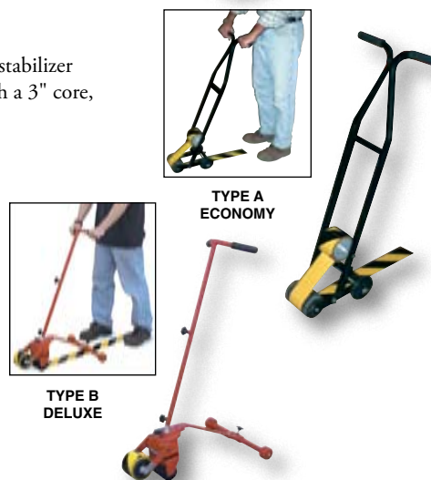
TYPE A ECONOMY