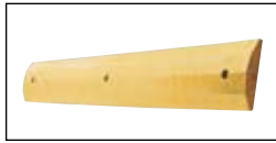
PLASTIC BUMPER model M-BUMP