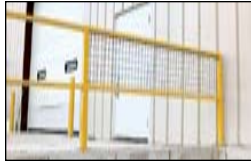
WIRE MESH FOR HANDRAIL series WM