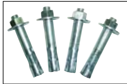
CONCRETE ANCHOR BOLTS model VDKR-KIT