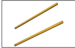
CONNECTION TUBING series CSEC