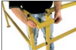
CORNER CONNECTORS model C-CON