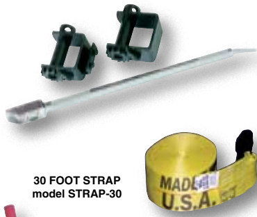
30 FOOT STRAP model STRAP-30