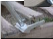
PALLET BUSTER model SKB-7