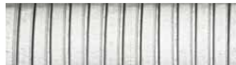
1000/2000 SERIES HOSE