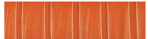
4000 SERIES HOSE

7000: The 7000 Series is unique with an outer corrosion resistant mechanical bond helix. A variety of temperature ratings are available within the series, from 300-degrees F up to a maximum of 2010-degrees F. Hose fabric varies depending on required temperature rating.