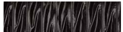
6000 SERIES HOSE