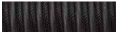
3000 SERIES HOSE