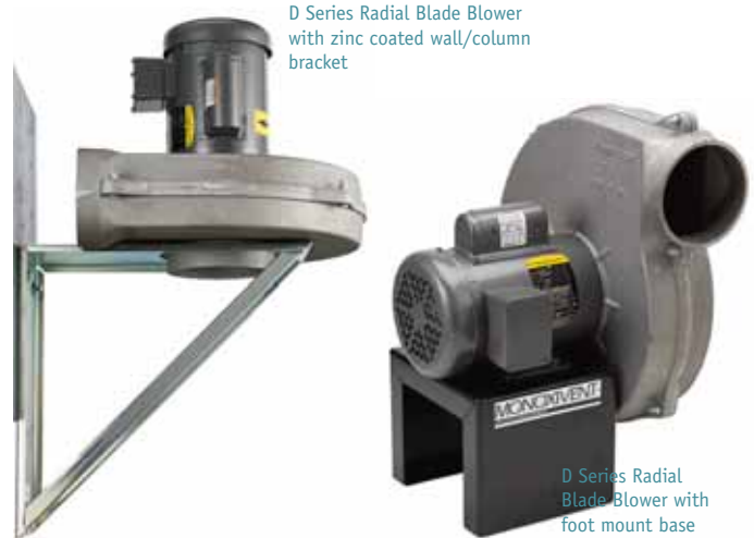
D Series Radial Blade Blower with zinc coated wall/column bracket