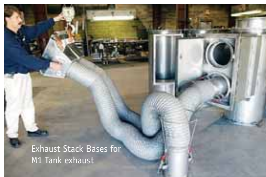
Exhaust Stack Bases for M1 Tank exhaust