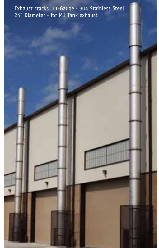
Exhaust stacks, 11-Gauge - 304 Stainless Steel 24" Diameter - for M1 Tank exhaust