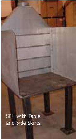
SFH with Table and Side Skirts

Slotted Fume Hoods are available in a vast array of sizes with numerous accessories. Side skirts are a common addition. The hood may also be connected to a welding table. A stainless steel construction is an option. Also, larger sizes are an option.