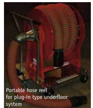
Portable hose reel for plug-in type underfloor system