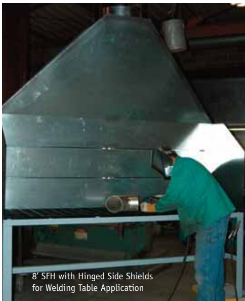
8' SFH with Hinged Side Shields for Welding Table Application