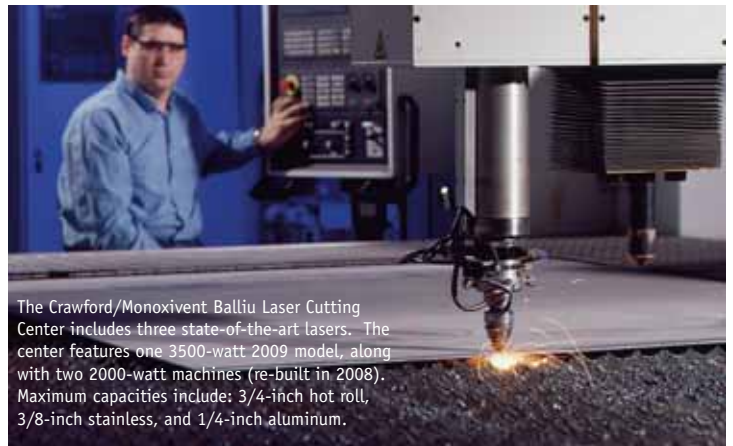
The Crawford/Monoxivent Balliu Laser Cutting Center includes three state-of-the-art lasers. The center features one 3500-watt 2009 model, along with two 2000-watt machines (re-built in 2008). Maximum capacities include: 3/4-inch hot roll, 3/8-inch stainless, and 1/4-inch aluminum.