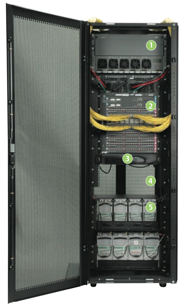
NterpriseIP<sup>™</sup> Front View