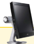
Liebert Monitoring & Shutdown