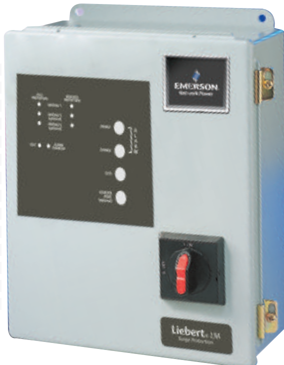
Standard LM Series SPD

The LM is a surge protective device (SPD) that offers continuous protection from damaging transients and electrical line noise. The LM utilizes patented circuitry to monitor the status of all protection modes, including neutral to ground. Should protection be unavailable in any mode, the green LED will be extinguished, and the red LED will be illuminated. In addition, high isolation form C dry contacts provide for remote monitoring of suppression system failure, under voltage, and phase and power loss. LM patented suppression integrity monitoring indicates failure for both shorted or opened suppression components.