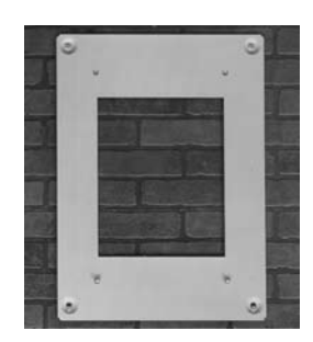
Wall-Mount Bracket for 25 and 50-Pair Closure BUPWM1