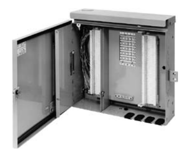
BEPC25C (25-pair) Quick-clip In & Out