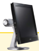
Liebert Monitoring & Shutdown