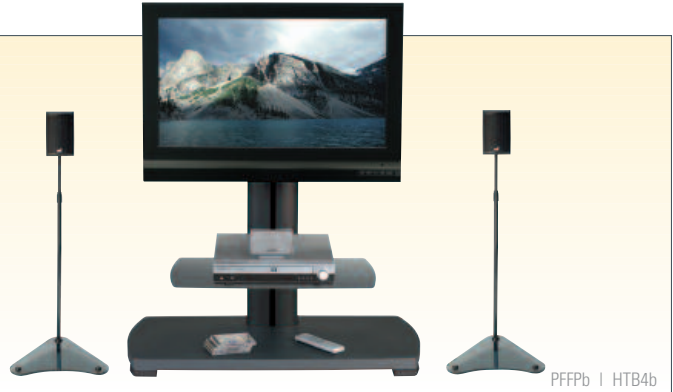
PFFPb | HTB4b

The perfect alternative when wall mounting is not possible , our TV stands offer extra-strong aluminum construction and thick tempered-glass shelves to display nearly any combination of AV components. Features include a cable management channel and Sanus' patented Virtual Axis™ or Virtual Axis 3D™ fingertip tilting technology.