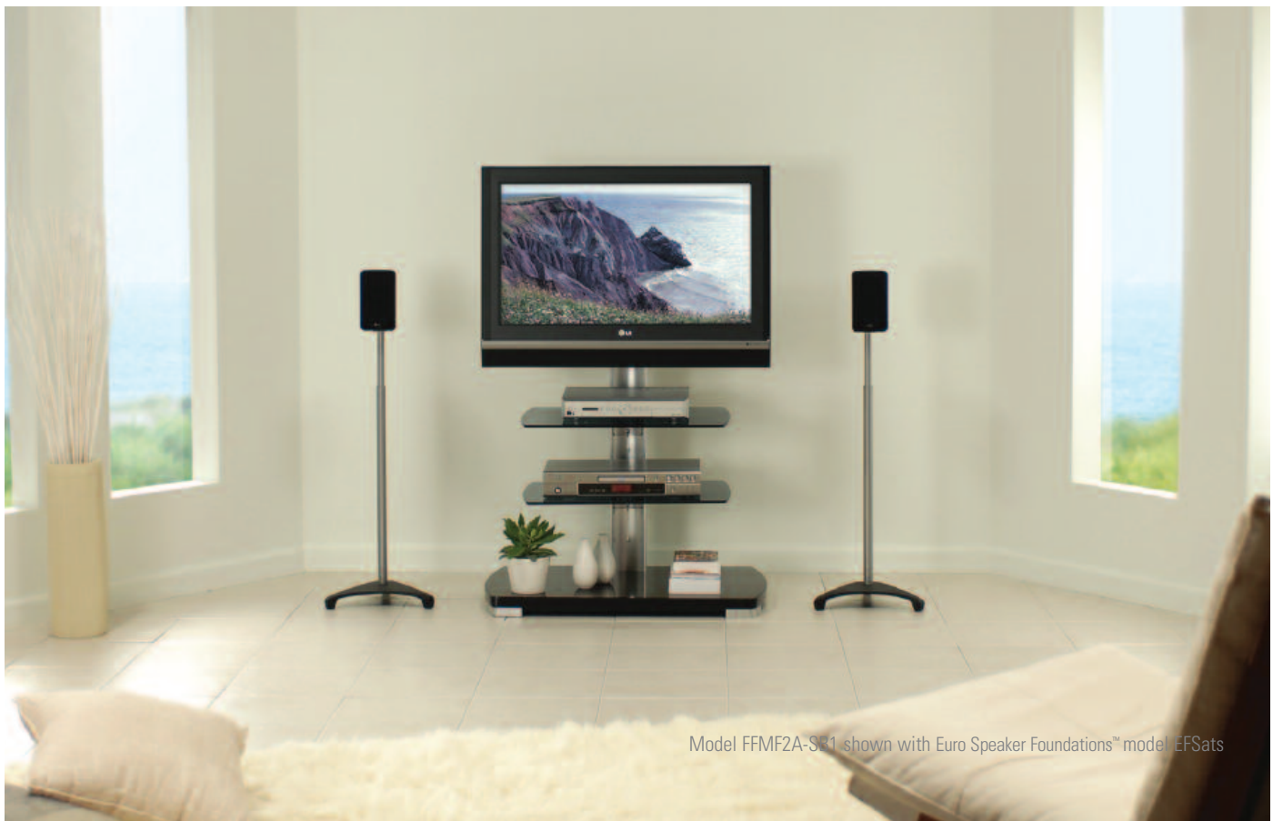
Model FFMF2A-SK1 shown with Euro Speaker Foundations™ model EFSats