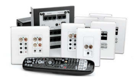
AU5544-XX IyriQ Multi-Source, Four-Zone Kit