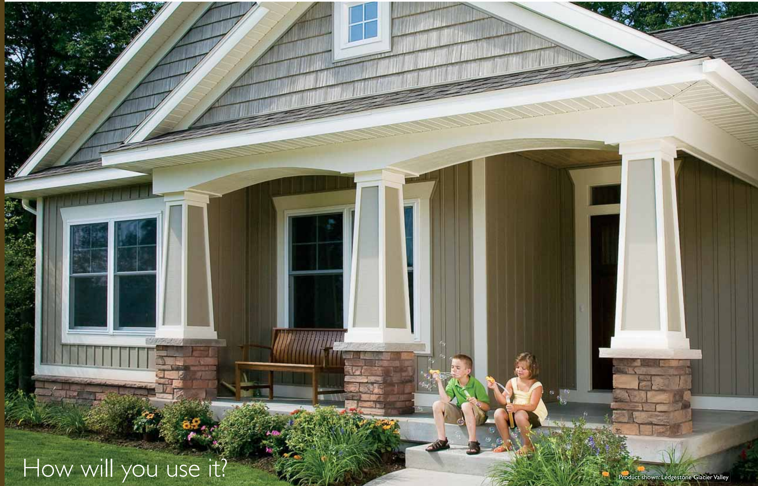
Product shown: LedgeStone Glacier Valley

ProStone® Veneer looks great anywhere, indoors or out. And where better than the entrance of a home?