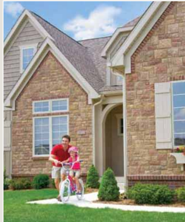
Product shown: Tuscan Cobble Vintage Wine

ProStone ® manufactured stone veneers meet AC-51 criteria, the strictest requirements in the industry.