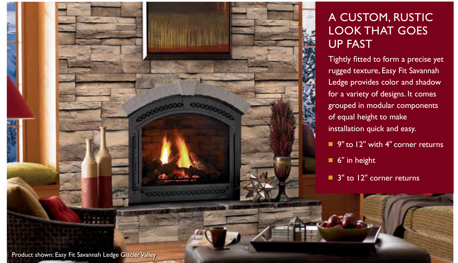
Product shown: Easy Fit Savannah Ledge Glacier Valley