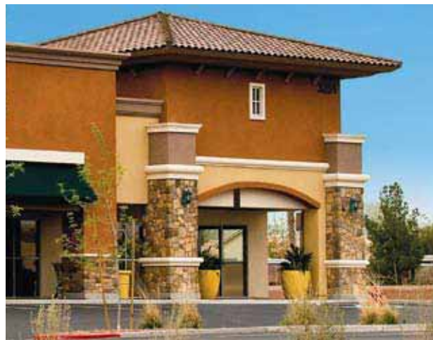
Product shown: Ledgestone Glacier Valley

The GREENGUARD® Environmental Institute recently named Owens Corning Masonry Products as the first stone veneer manufacturer to qualify for its Indoor Air Quality Certification and stringent Children & Schools product emission standards. All GREENGUARD® products have been tested for chemical emissions performance. The certification reflects Owens Corning's corporate commitment to sustainability and healthier indoor environments.