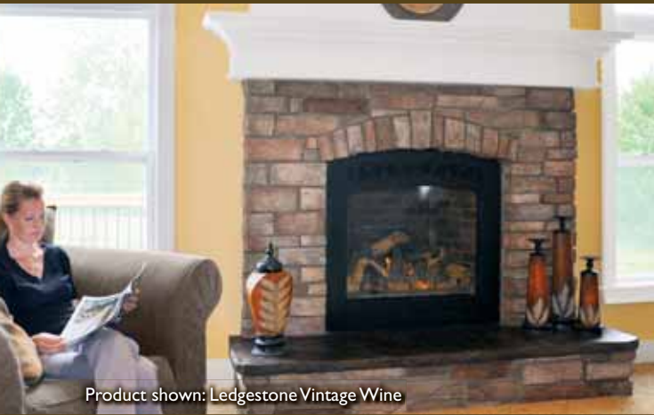
Product shown: LedgeStone Vintage Wine