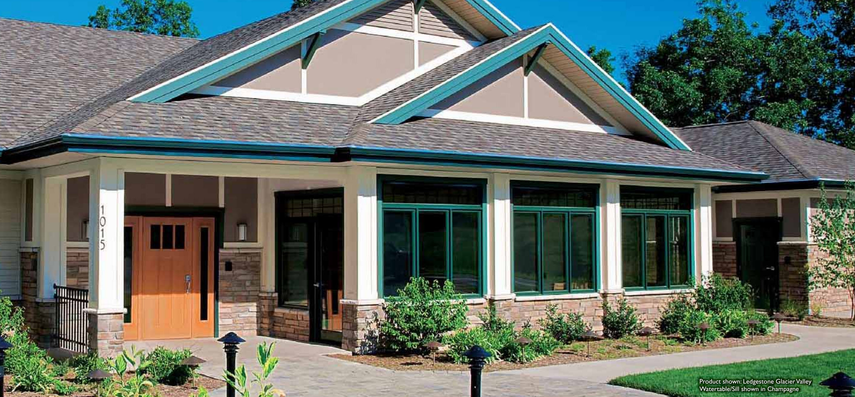
Product shown: Ledgestone Glacier Valley Watertable/Sill shown in Champagne