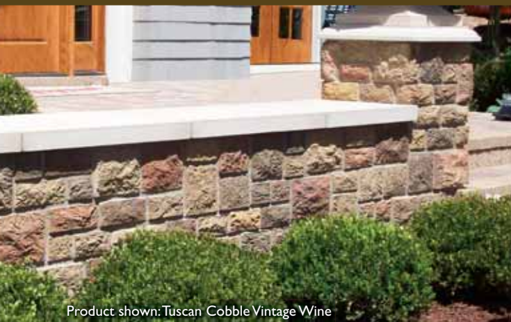
Product shown: Tuscan Cobble Vintage Wine

Bring warmth and character to any part of your home: the kitchen, basement — even an outdoor living space.