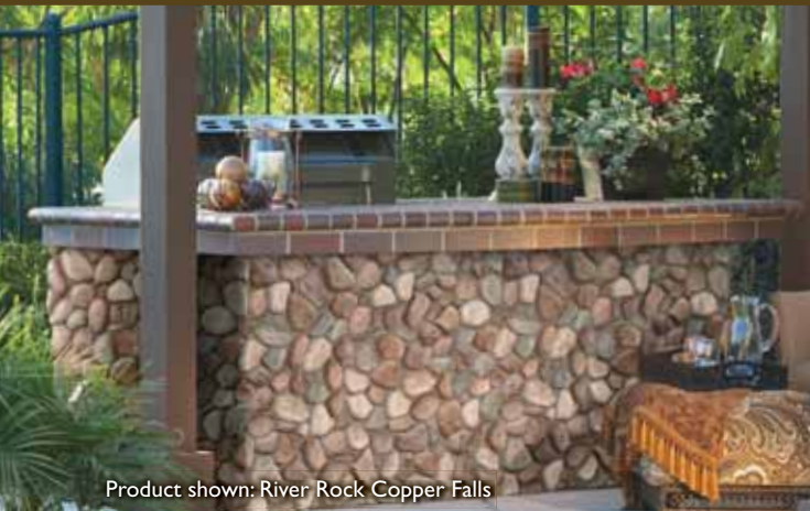
Product shown: River Rock Copper Falls

ProStone® Veneer is an affordable way to turn an ordinary room into a place you want to spend more time. A real living room.