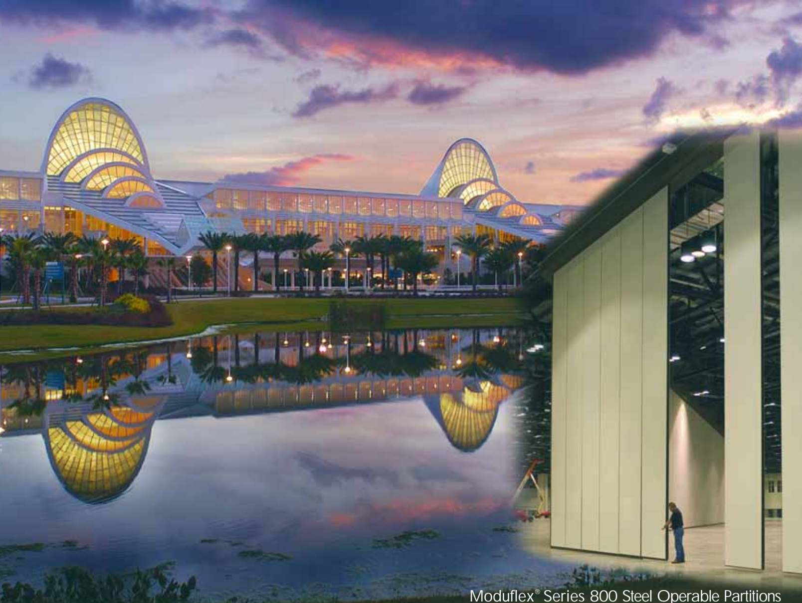
Moduflex® Series 800 Steel Operable Partitions Orange County Convention Center*, Orlando, Florida

Operable Partitions • Accordion Partitions Portable Panel Partitions • Acoustical Panels • Folding Doors