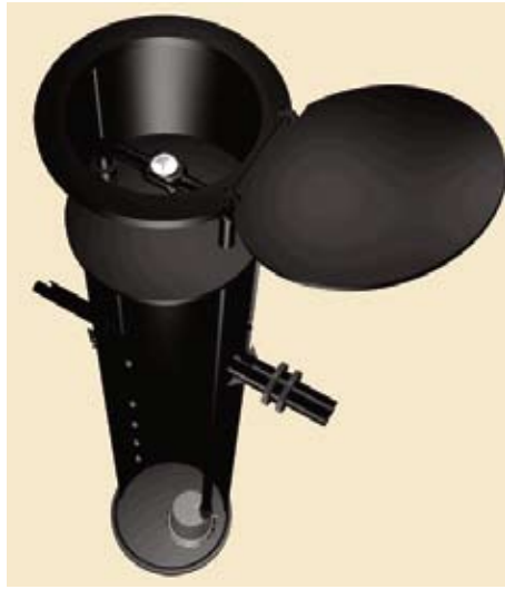
Figure 2: Dual Containment Pump Station