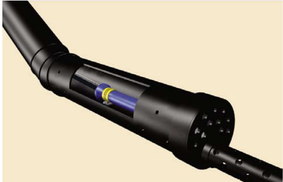
Figure 6: Side Slope Riser