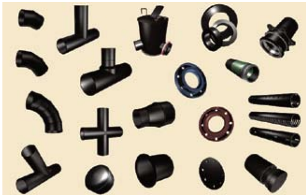
Figure 4: Assorted Fittings