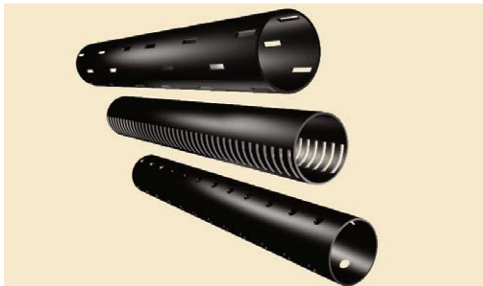
Figure 1: Prefabricated Perforated and Slotted Pipe

Below and on the following pages are pictures of various types of HDPE fabricated products. Please keep in mind, "If you can design it, ISCO can fabricate it." Our HDPE fabrication capabilities are endless. We have been a leader in this industry since 1976.