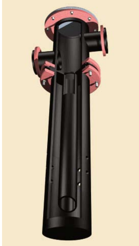
Figure 3: Condensate Sump Trap