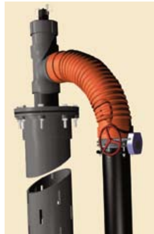
Figure 5: Gas Well Head