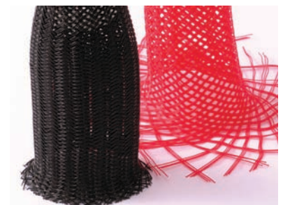
When scissor cut, the end of Clean Cut will withstand heavier handling without fraying than standard PT.