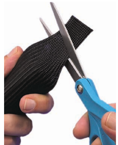
Clean Cut cuts easily and neatly with regular scissors and maintains a fray resistant end during installation.