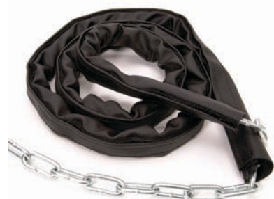
DW protects chains from harsh environments, as well as protecting wood or finished surfaces from scuffing and other damage.