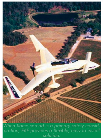
When flame spread is a primary safety consideration, F6F provides a flexible, easy to install solution.