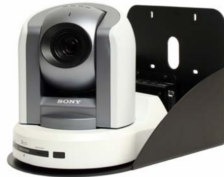
Figure 1: (top) Quick-Connect CCU 1 RU rack mount interface; (bottom) WallVIEW CCU 300 System with Camera, EZIM and Wall Mount

The Vaddio WallVIEW CCU 300 is built around the Sony® BRC-300 standard definition pan/tilt/zoom camera. With three 1/4.7 CCDs, the BRC-300 is an ideal choice for a wide range of video applications. WallVIEW CCU 300 allows the user to adjust color, gain and iris functions on the camera (see Figure 1). These controls allow the camera to deliver a more accurate representation of the image that is being captured. The other added advantages include the ability to color match multiple cameras and make necessary changes to iris and gain quickly and easily. Settings may be stored by using two Scene buttons for various lighting conditions. The WallVIEW CCU uses high speed differential signaling (HSDS), an active video transmission system, to deliver high quality video over standard Cat. 5 cabling. Adjustments allow the video to be extended up to 500 feet from the Quick-Connect CCU with virtually no loss in video quality.