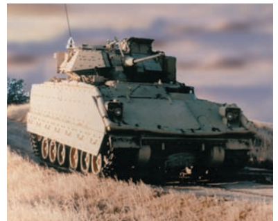
NM's qualities make it a viable choice for defense and military applications that call for flexibility, strength and full coverage protection.