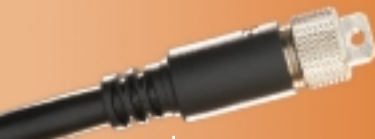
EZLINX metal pull-cap

Our plates and panels are available in a broad assortment of VGA, BNC, RCA, Analog DVI and S-Video connector options. Liberty's stock plates and panels are offered in brushed aluminum, black, white, ivory and non-brushed aluminum. Custom colors, wood-grain matching and PMS colors are also available. Call us today for details.