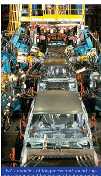
d through door & body caviti