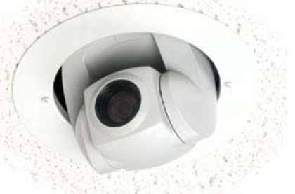
Figure 1: CeilingVIEW 70 PTZ HideAway Extended (above) and retracted (left)

INSTALLED PTZ CEILING CAMERA WITH MOTORIZED CAMERA LIFT SYSTEM