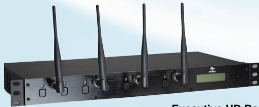
Executive HD Base Station