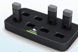
HD Charger Base