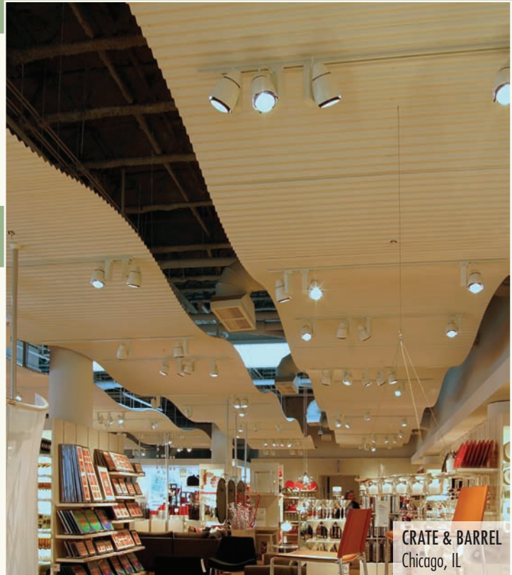
CRATE & BARREL Chicago, IL