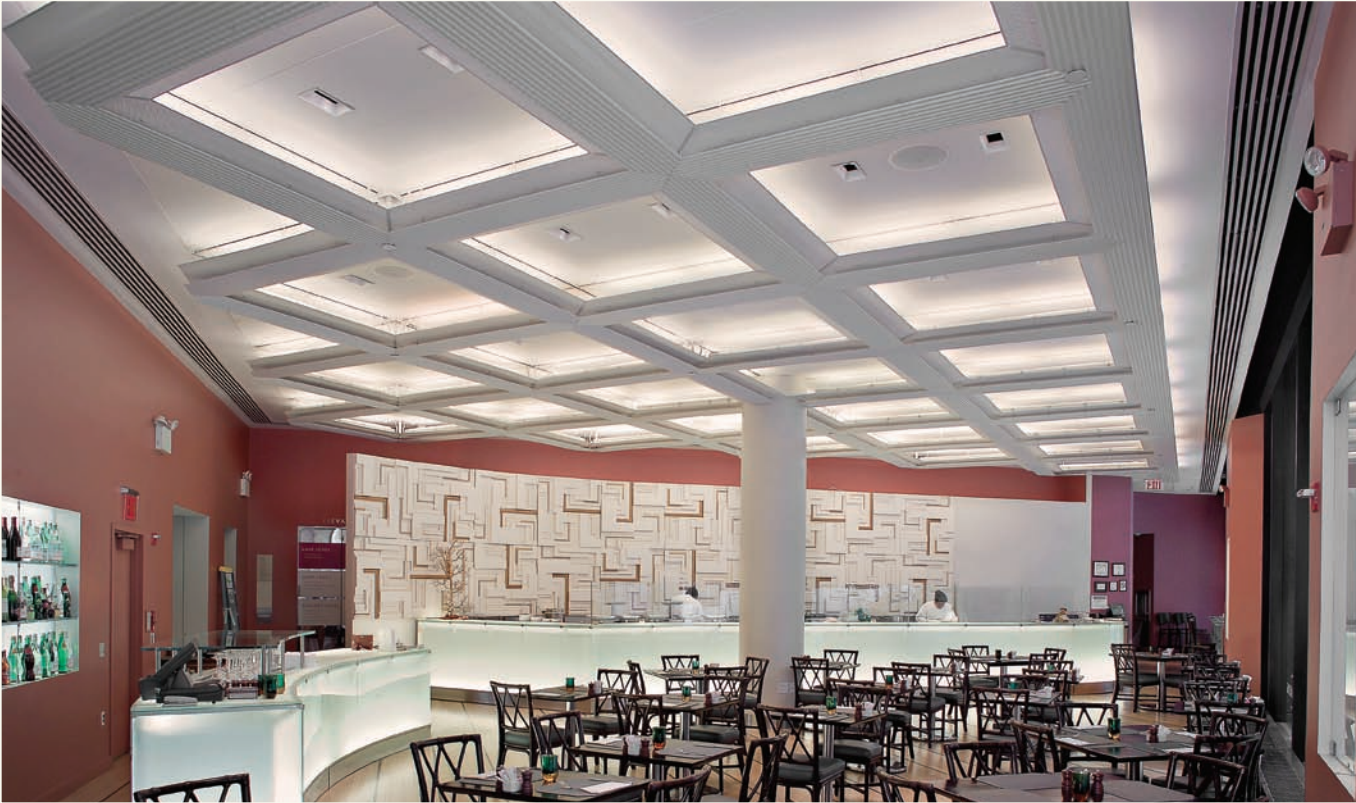
Custom Ceilings with ALPRO Factory Mitered Corrugated Panels and Non-Corrugated Panels featuring Integrated Lights and Sprinklers