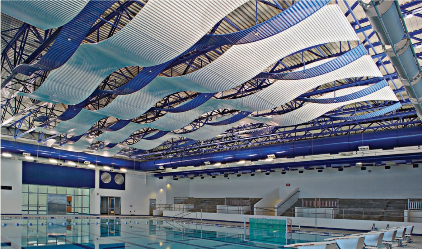
Undulating Ribbon Ceilings Integrating Curved T-Grid Frames with Lay-In ALPRO Corrugated Panels