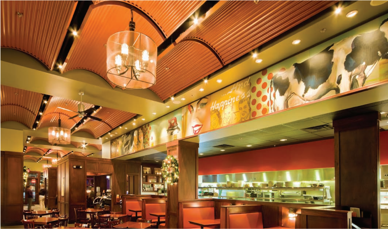
Decorative Vaulted Ceilings with ALPRO Corrugated Lay-in Panels, Curved Perimeter Trims, and Suspension System