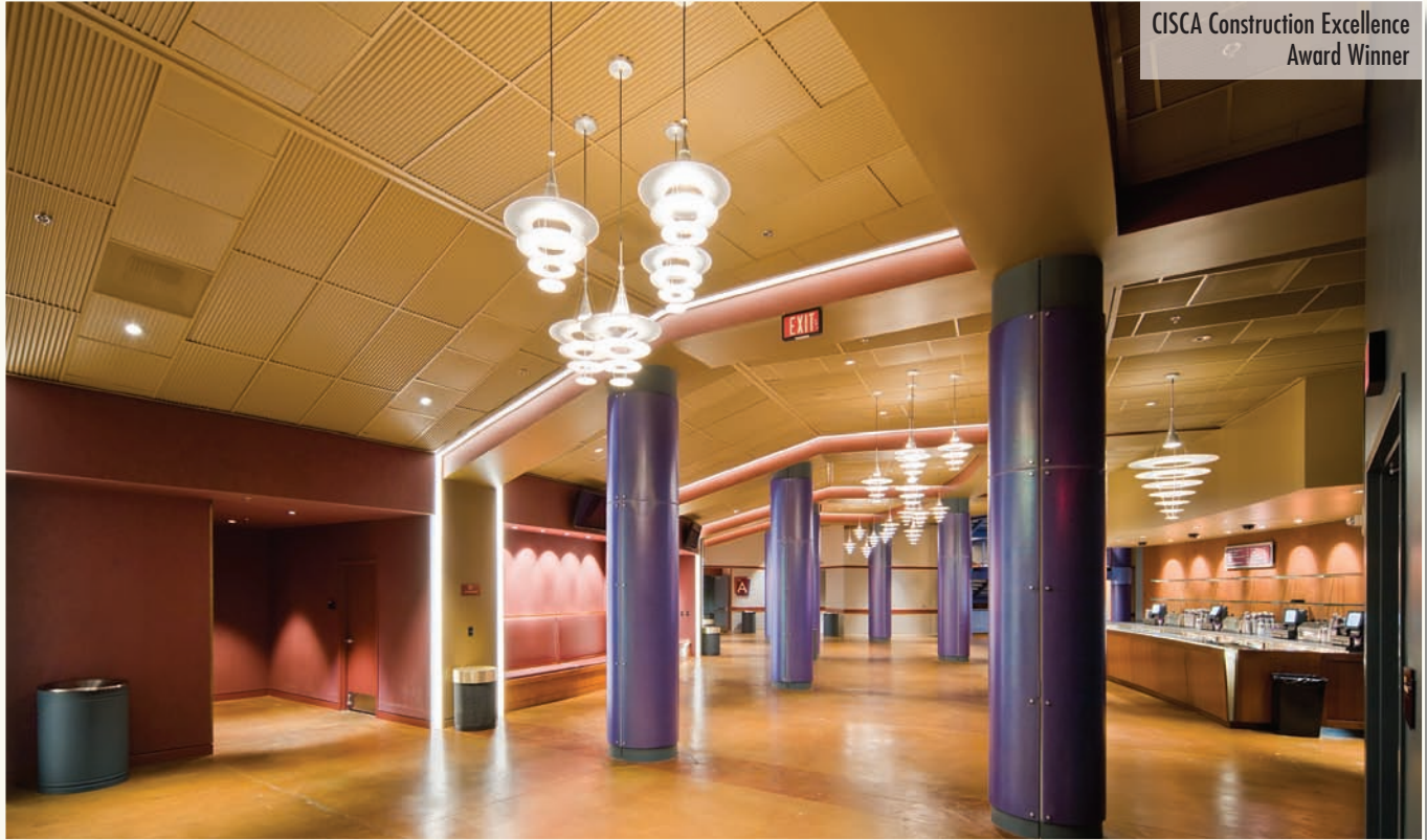
ALPRO Corrugated Lay-in Panels with Multiple Module Sizes and Corrugation Patterns