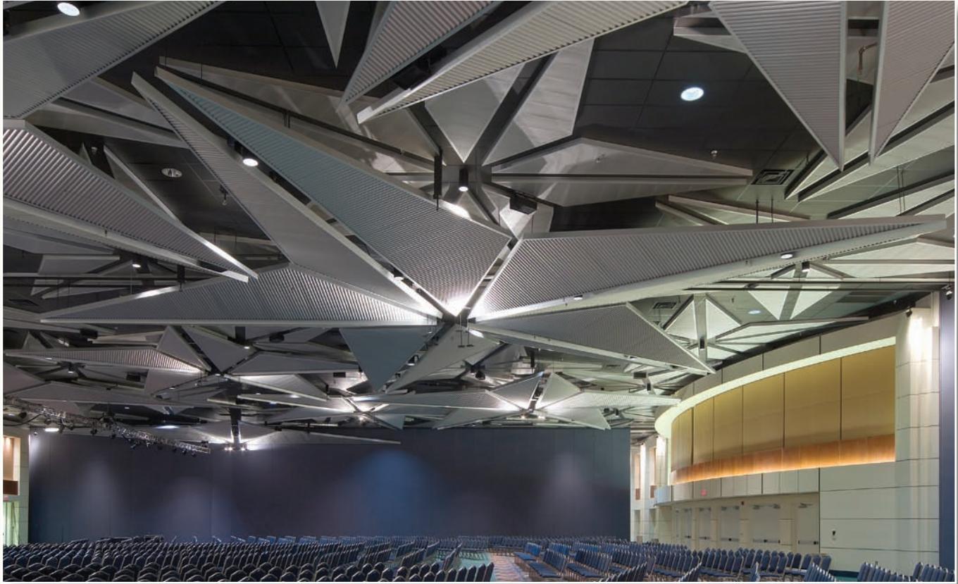
3 Dimensional Star Shaped Clouds with ALPRO Corrugated Panels and Compound Mitered Perimeter Trims, Face-Attached to Concealed Suspension System