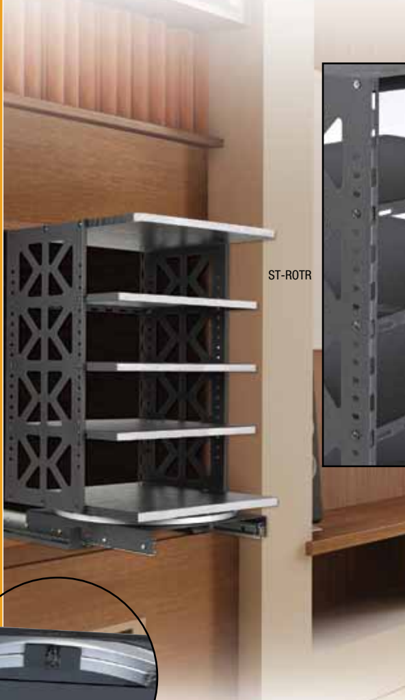
Integral cable management

Employing the same heavy duty base and sliders as our ROTR, the ST-ROTR will handle loads up to 275 pounds of non-rack mount equipment. Construction is of 14 and 16 gauge cold, rolled steel, including the adjustable, vented shelves. Shelves include moveable brackets to secure components in place and eliminate sliding. Brushed aluminum bar stock dresses the leading edge of each shelf. The rack extends a full twenty inches from its frame and is then capable of rotating 90 degrees in either direction, allowing unobstructed access to components regardless of their depth. The system locks in the closed position with security panel and screws provided. Easy and effective cable management system.