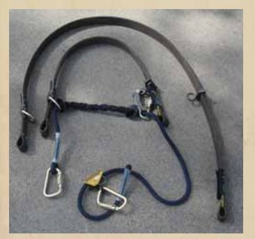
Cynch-Lok™ gives you the ability to interchange straps, depending on the diameter of the pole.