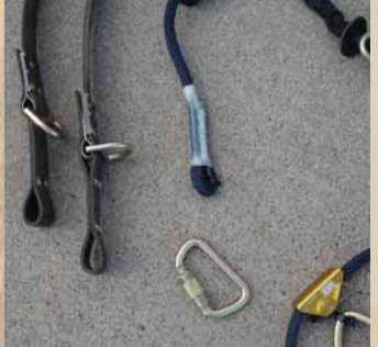
Remove body support carabiner on rope end and thread through D-ring on distribution strap.