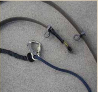
Remove cleated carabiner from Cynch-Lok™ adjuster on distribution strap.