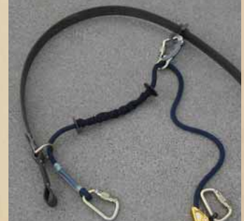
Reverse steps on transmission strap to complete the exchange. It's a "cynch"!