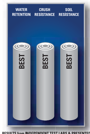
RESULTS from INDEPENDENT TEST LABS & PRESENTED as COMPARISONS to OTHER NoTRAX® ENTRANCE MATS