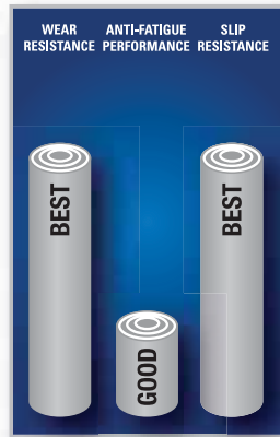
RESULTS from INDEPENDENT TEST LABS & PRESENTED as COMPARISONS to OTHER NoTRAX® INDUSTRIAL MATS