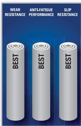
RESULTS from INDEPENDENT TEST LABS & PRESENTED as COMPARISONS to OTHER NoTRAX® FOOD SERVICE MATS