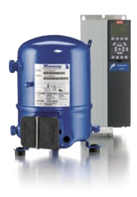
Precision Cooling. The VTZ is the intelligent, variable speed solution for industrial and multi-evaporator commercial refrigeration.