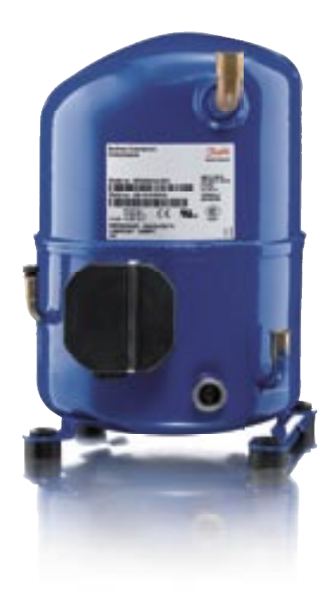
MPZ: especially for factory assembled medium temperature (+10°C to -30°C) refrigeration systems and subassemblies.