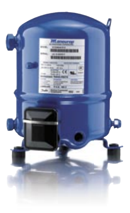
NTZ: dedicated to low temperature (-10°C to -45°C) refrigeration and storage.